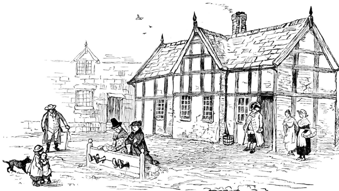
Fig. 2. Randolph Caldecott's sketch of Flint's 'old Town-hall' (Taylor 1883, 179)

In taking down the old Town-hall of Flint, for the purpose of building a new market-place and Town-hall, the workmen discovered, under one of the corner-stones, a considerable quantity of silver coins of the reign of Edward II. 38